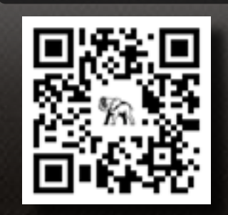
SCAN TO VIEW ONLINE

AVAILABLE PAINT COLOR CHOICES NOTE: ACTUAL COLORS MAY VARY